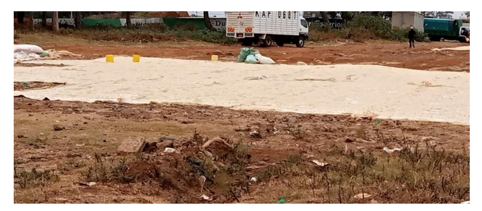
Figure 5: The Sun Drying of Maize in Uasin Gishu County.

bags promote the growth mostly when the feed content in the bags have not been dried enough (D'Orazio, 2012). Fungi are aerobic micro-organisms, and recent technologies have been developed that helps in reducing oxygen content and increase carbon dioxide content, therefore, reducing mycotoxin growth (Abigael et al., 2018; Bordin et al., 2015). Currently, in Kenya, hermetic improved bags are being used by heavy commercial traders with few farmers in storing animal feeds. (Rose et al., 2018). Other measures reported in other studies included; buying animal feeds in small quantities that can sell quickly (Abbas et al., 2006; Bruns, 2003); unlike what was observed, the most store had piles of stock that have not been sold for more than six months. Hence, exposed to a high risk of contamination.