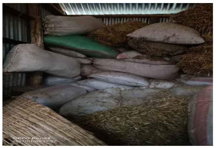
Figure 4: Mixed Farmer's Store in Uasin Gishu.