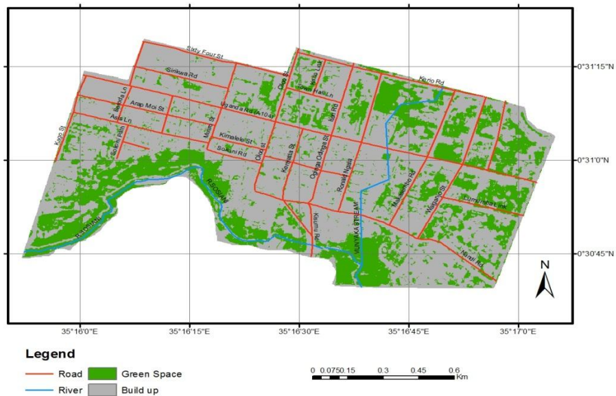
Figure 2. Green and Non green

The results show that green areas cover 465,567 m 2 -an area equivalent to 26% of the total study area and a per capita green space value of 2.5m 2 . This falls below the standard (9 m 2 per capita green space) recommended by WHO (2010) indicating a shortage of 6.5 m 2 per capita green space an equivalent of approximately 1,676,041 square meters of green space. There is need to increase the amount of green space at least 4.5 times the existing situation to reach the minimum set standards of 9m 2 per capita.